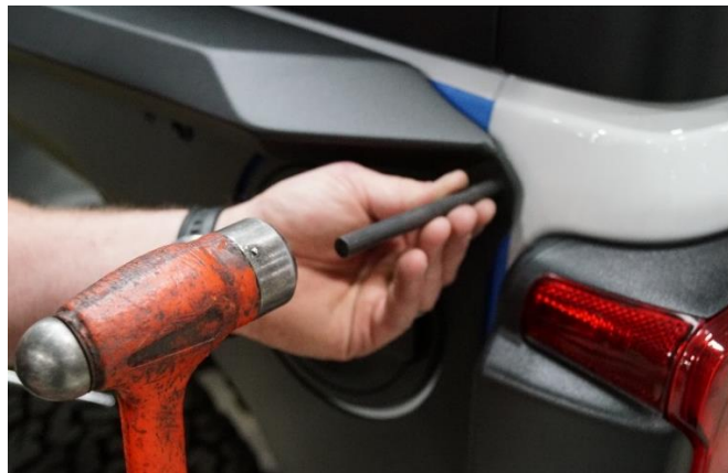
Figure 7. Marking hole locations with transfer punch.