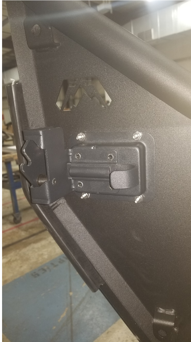
Figure1: rear door latch orientation