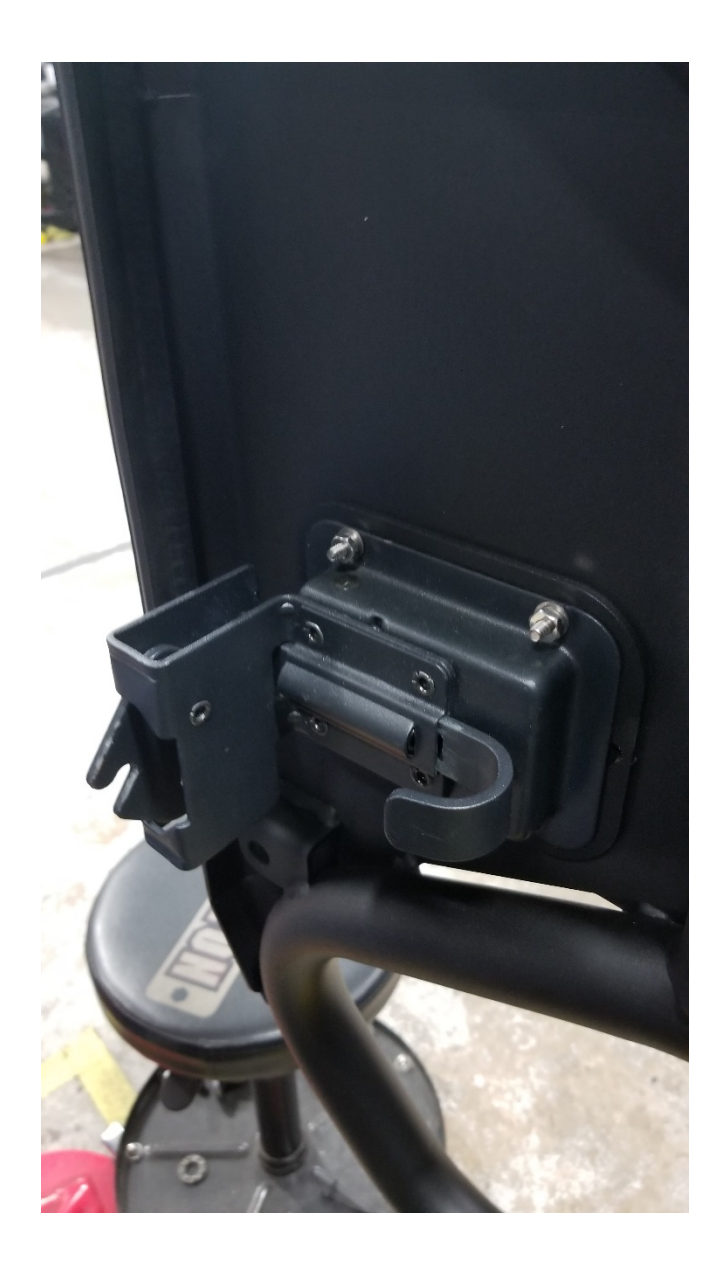
Figure1: front door latch orientation