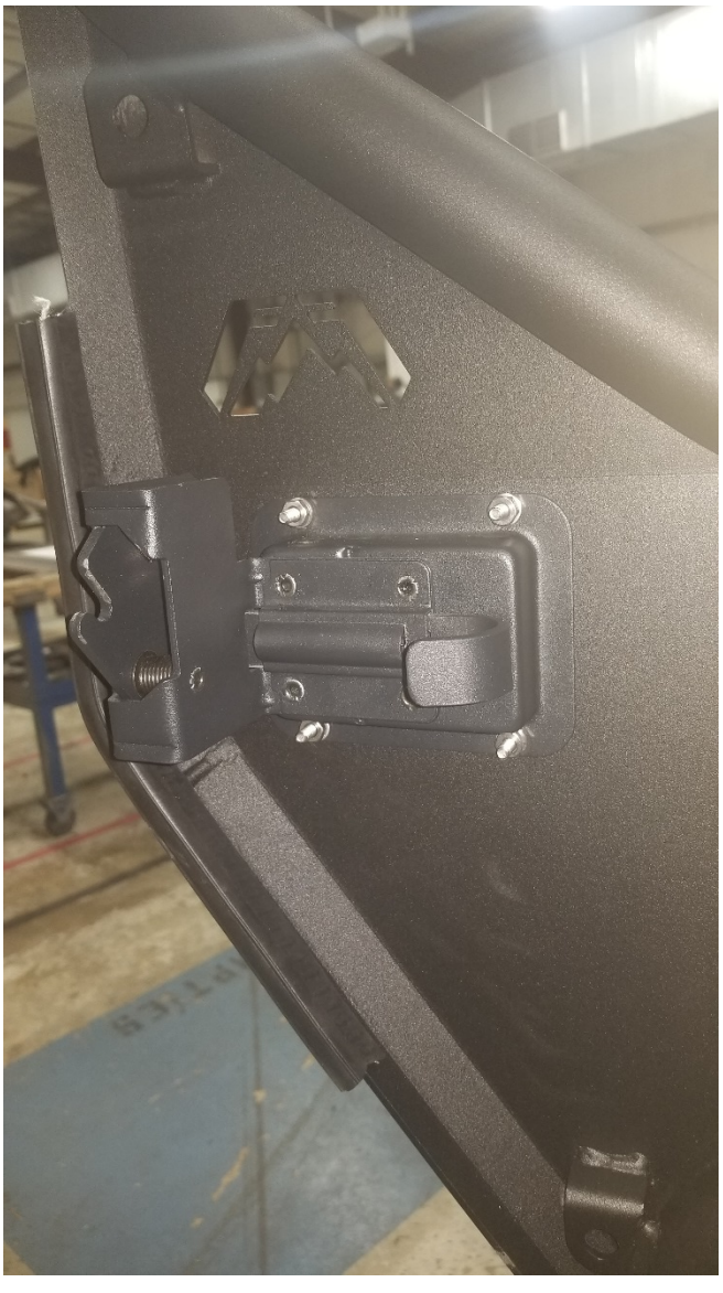
Figure1: rear door latch orientation