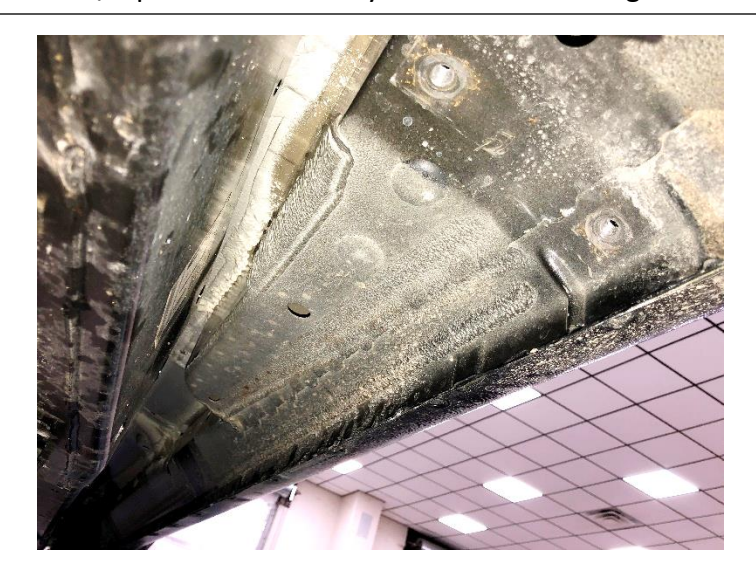
STEP 4 : Carefully place step into place and loosely fasten using the supplied M10X25mm hardware.

STEP 2: Remove any factory running boards or hardware and discard. STEP 3: Clean/tap the three factory threaded mounting locations.