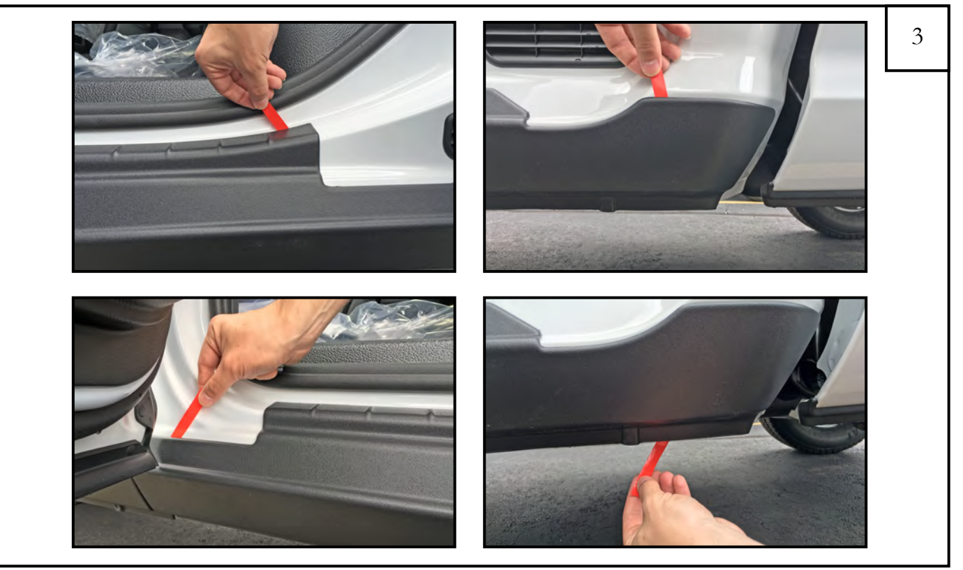
Set part in place on vehicle. Remove all red tape liners. Apply FIRM pressure to mounting locations to affix to truck.

Note that there is a strip of tape under the sill plate.